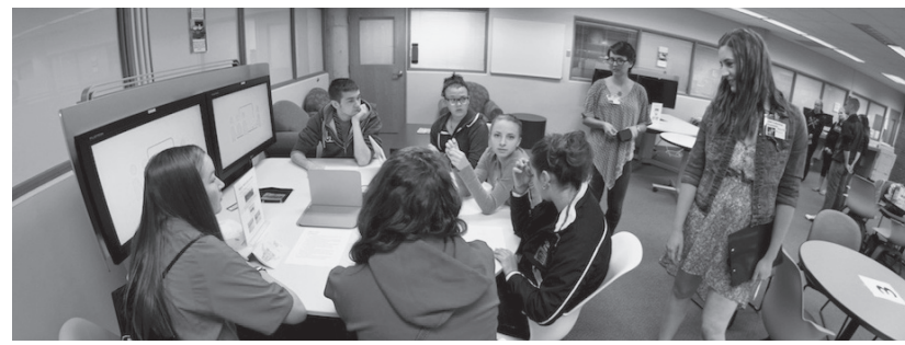
Academic and Research Commons

What lies ahead? We are busy providing the best academic support for our students and faculty, teaching 70+ University 101 classes, literacy skills, and conducting courses in LIB 110, 345, and 496. Visit the library to see all that's going on!