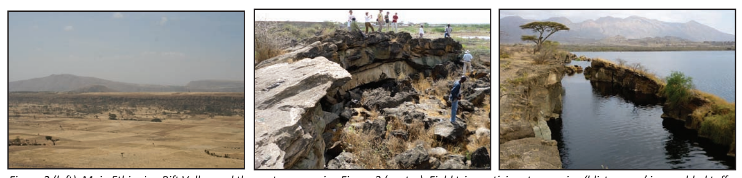
Figure 2 (left). Main Ethiopian Rift Valley and the eastern margin. Figure 3 (center). Field trip participants examine 'blister cave' in a welded tuff in the southern Afar. Figure 4 (right). A fissure of the edge of Lake Besaka. Fantale volcano is in the background; it last erupted 170,000 years ago.

normal faulting occurs during the diking process, regions where magmatism has occurred are less seismically active. More broadly in the region, rift basalts show expected age progression with the youngest basalts at the center of the rift, and pointing to a spreading rate of 12 \pm 1 mm/yr. However, less clear is off-axis magmatism, which shows no simple age progressive trend.