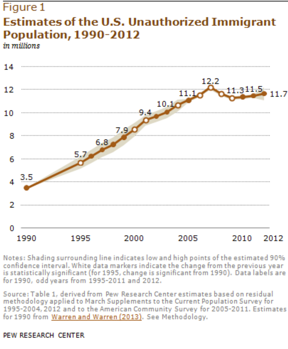
Figure-2. 5 “Facts about Illegal Immigration in the U.S.” Pew Research Center RSS. November 19, 2015 http://www.pewresearch.org/fact-tank/2015/11/19/5-facts-about-illegal-immigration-in-the-u-s .

government services to undocumented immigrants approached $3 billion during a single fiscal year” (Camarota,2004).