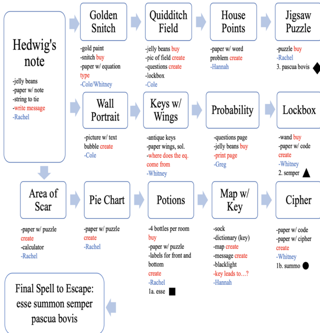
Figure 1. Harry Potter Escape Room Planning Web.

on campus. Rather than starting with the creation of individual puzzles, we worked together to create a web (see Figure 1) for the escape room, which served as an overall map for the room. The web provided clear directions as to which puzzles connected to one another and in which order, along with details about each puzzle [13]. See Appendix A for a complete outline of the planning process and the puzzles for the Harry Potter Escape Room.