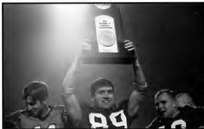
North Dakota won its first NCAA Division II football title a year ago, defeating Grand Valley State, 17-14, in the title game.