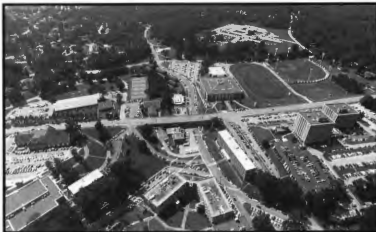
Florence, Alabama, and "The Shoals" offer an abundance of entertainment options, including great fishing and football.

• Indian Mound — This mound was built around 500 A.D. during the Woodland period. It is the largest domiciliary mound in the