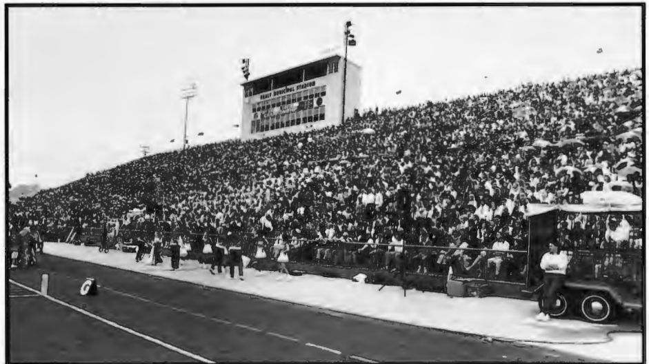
Braly Municipal Stadium in Florence, Alabama, has been the site of the NCAA Division II Football Championship game for the last 16 years.