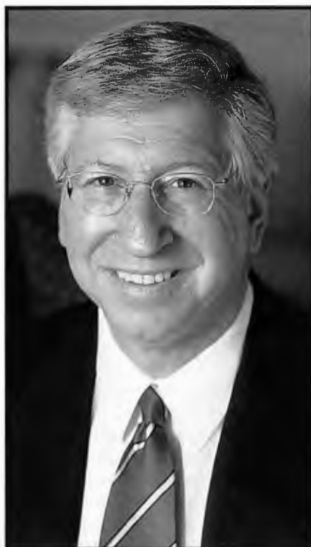
Dr. Myles Brand NCAA President-Elect

The integration of athletics and academics received a lift with the announcement in September of the latest graduation rates for student-athletes. For the first time since the federal government has been collecting graduation data and the NCAA began publishing the results a dozen years ago, student-athletes in Division I are achieving a 60