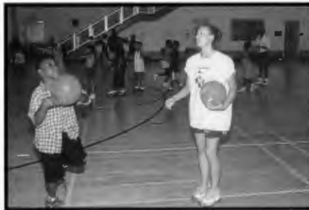
The NYSP initiative is a five-week program conducted on 190 college campuses.

Even if most people can't name all the sports, these NCAA-sponsored events bring more to the communities than zealous fans with banners and painted faces. They also bring the opportunity of a lifetime for children.