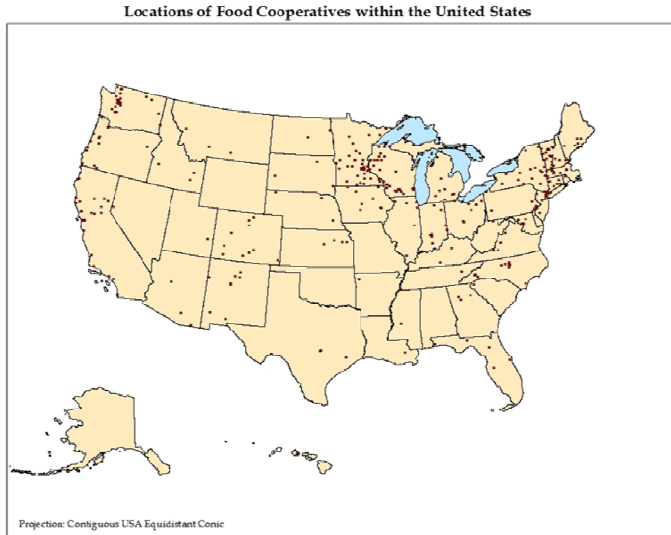
Figure 1. Location of Food Cooperatives within the United States (created by author).