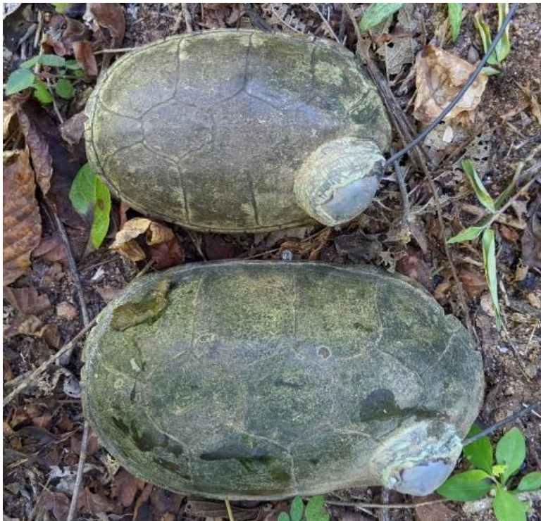
FIG. 4. Two typical adult males from the Chamela Forest demonstrating the differences between small (above) and large males (below).