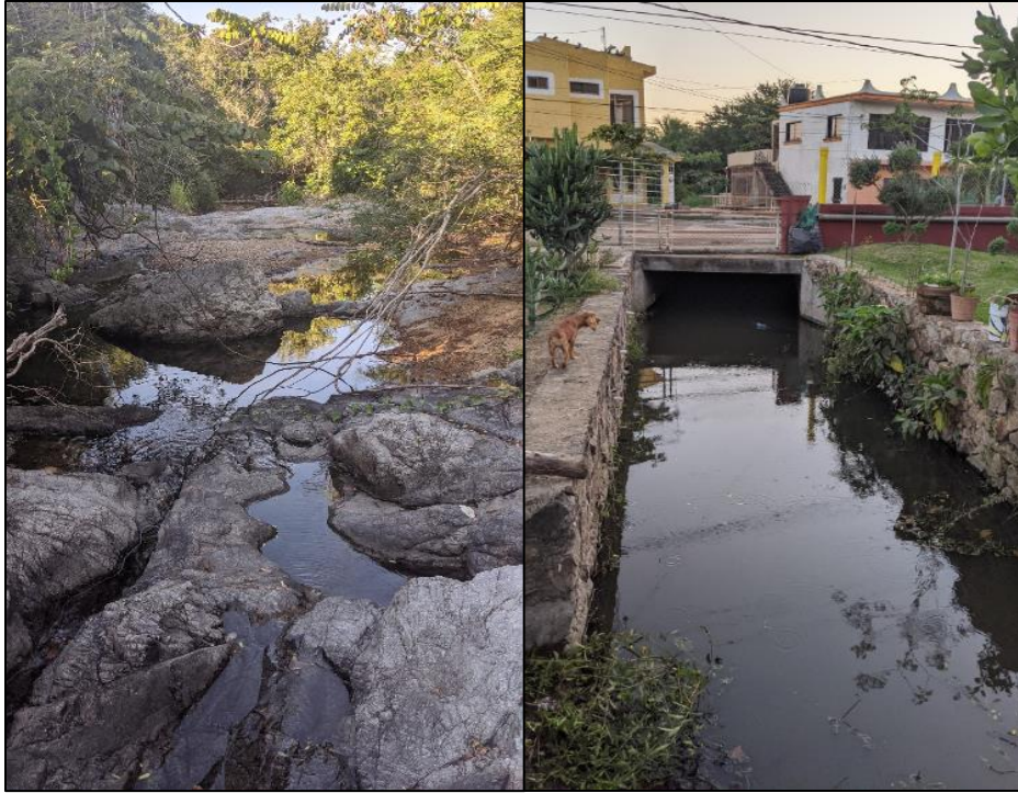
FIG. 1. An arroyo sampled in the forest habitat from the Chamela-Cuixmala Biosphere Reserve (left) and the exposed semi-urban habitat sampled from the nearby town's central irrigation canal (right).

Results; Abundance. — In four years of mixed sampling effort in the Chamela Forest, we marked a total of 37 turtles, with four recaptures. Forest trapping efforts from 16 trap nights in July and December 2019 yielded 12 turtles, while the remaining 25 captures were opportunistically encountered from 2015–2018. Recapture data in the forest were not sufficient to calculate a precise population estimate. In a 400 m reach of the town ditch, 12 trap nights from July and December 2019 yielded 224 captures of 206 individuals. During two nights of sampling in July, 44 turtles were captured in the first night and 94 the second night with five recaptures. In two nights of trapping in December, the first night yielded 28 turtles with nine recaptured from July. The second night yielded 68 turtles with six additional recaptures from July and no recaptures from the previous night. No turtle was captured more than twice during the entire sample period.